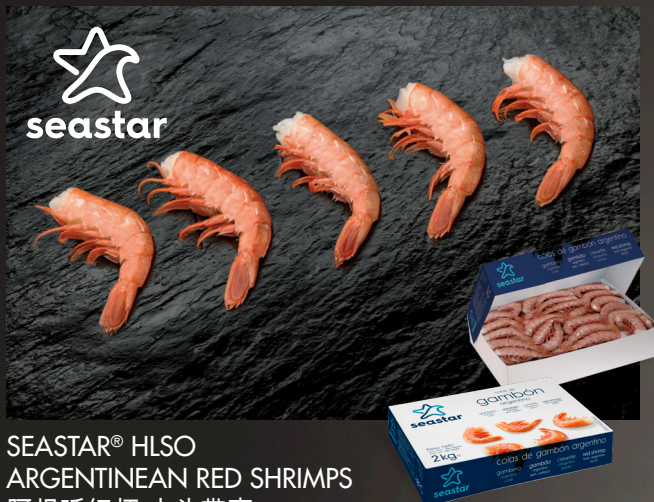
SEASTAR® HLSO ARGENTINEAN RED SHRIMPS 阿根廷红虾 去头带壳 Size / 尺寸: C1 35-55, C2 56-100 p/kg Specifications: raw / 特点: 生食 Packaging / 包装: 6x2 kg Net weight / 净重: 12 kg