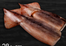
Specifications: tubes / 特点: 管 Size / 尺寸: -18, 18-23, 23-28, 28+ cm Packaging: block / 包装: 块. Weight / 重: 20 kg approx.