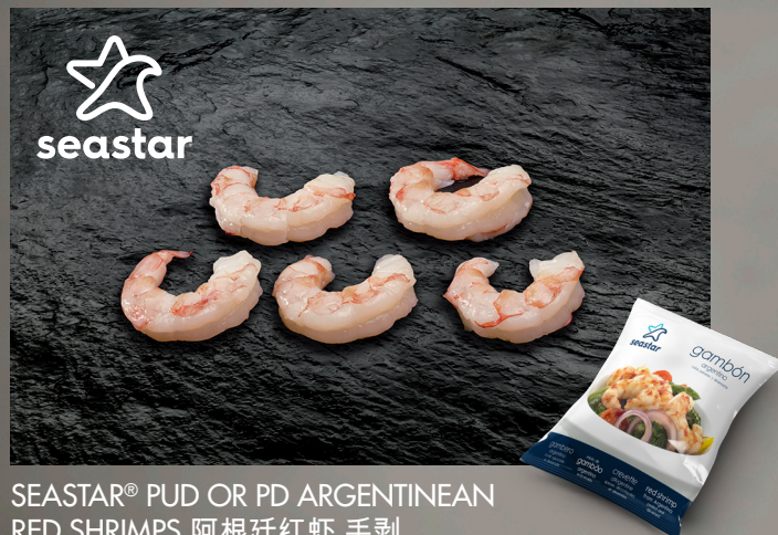
SEASTAR® PUD OR PD ARGENTINEAN RED SHRIMPS 阿根廷红虾 手剥 Size / 尺寸: 10-30, 30-50 p/lb Specifications: IQF, raw, peeled & deveined / 特点: 生食 Packaging / 包装: 5x1 kg Net weight / 净重: 4 kg