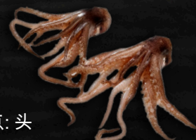
Specifications: tentacles / 特点: 头 Size / 尺寸: -60, 60+ cm Packaging: block / 包装: 块. Weight / 重: 12 kg approx.