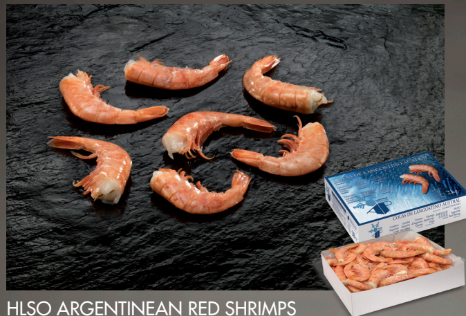
HLSO ARGENTINEAN RED SHRIMPS 阿根廷红虾 去头带壳 Size / 尺寸: C1 35-55, C2 56-100 p/kg Specifications: raw / 特点: 生食 Packaging / 包装: 6x2 kg Net weight / 净重: 12 kg