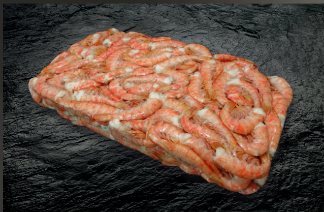
HLSO ARGENTINEAN RED SHRIMPS 阿根廷红虾 去头带壳 Size / 尺寸: C1 35-55, C2 56-100, CR/MIX p/kg Specifications: raw / 特点: 生食 Packaging / 包装: 3x6 / 9x2 kg Net weight / 净重: 18 kg